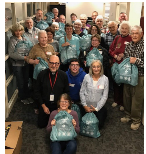
Members of Jerusalem Evangelical Lutheran Church in Lititz, PA, helped me (kneeling in black) assemble Christmas-at-Sea satchels in November 2023.