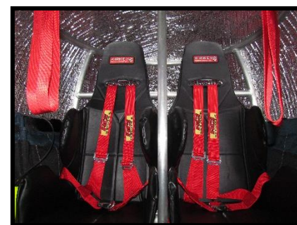
It is kind of cool looking! <g>

Sunday, April 18 worship videos are now available for local churches to access for streaming or downloading. A full worship video as well as individual component videos are available here.